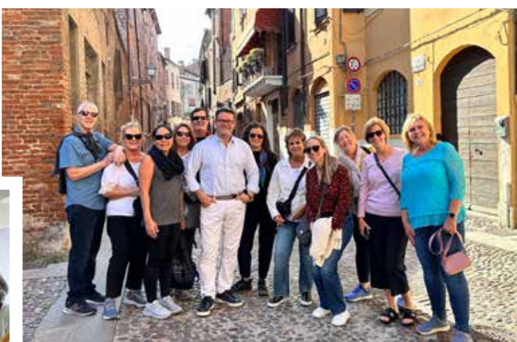
Above: This group of DLM Food Explorers began their journey as new acquaintances and left as friends as they all shared a common passion for good food and adventure. The nine-day trip to the Emilia-Romagna region opened the door to unique experiences, gourmet adventures, hidden gems, and sights to behold.