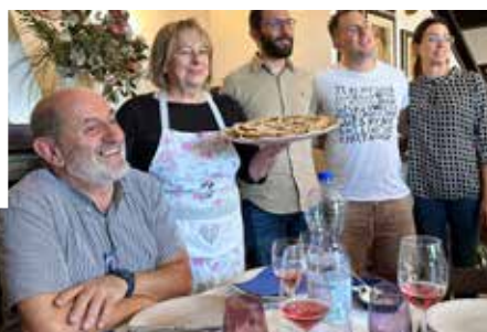
Above: A tour of the Minelli estate, including the parmigiano-reggiano aging room. Below: The Minelli family prepared a multi-course lunch highlighting this great cheese as well as a tasting of it aged 2-10 years.