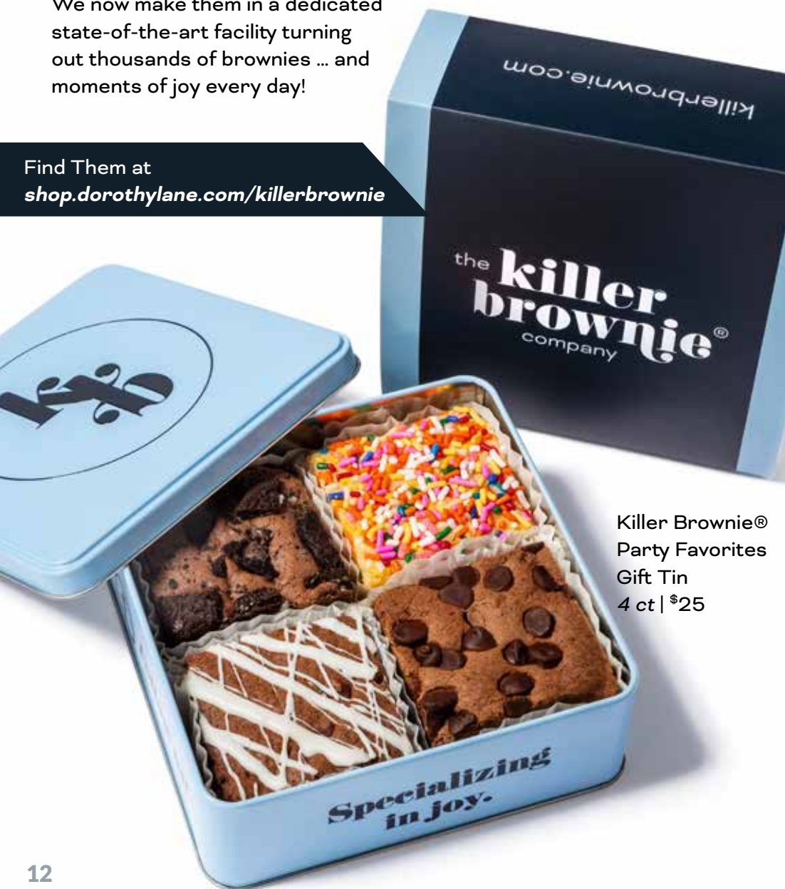
Killer Brownie ® Party Favorites Gift Tin 4 ct | $25

Find Them at shop.dorothylane.com/killerbrownie