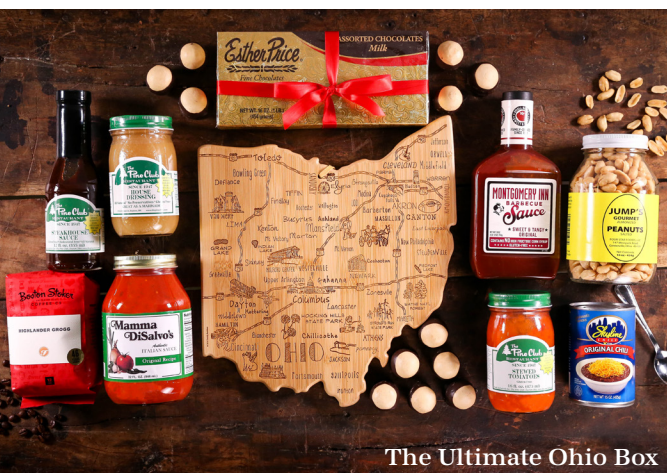
The Ultimate Ohio Box

Add an Ohio-shaped cutting board to elevate this OHIO experience. | $30